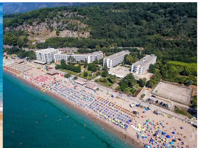
Some of the beautiful natural sandy beaches in Bar and surrounding Bar (Summer season since 1st May to 1st October)