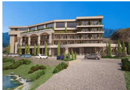
Venue of Second Day of the Bar Conference on the Skadar Lake Side